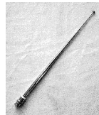
Telescoping Antenna See page 65