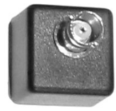
VLF Probe See page 65