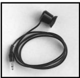
Magnetic Pick-up See page 65